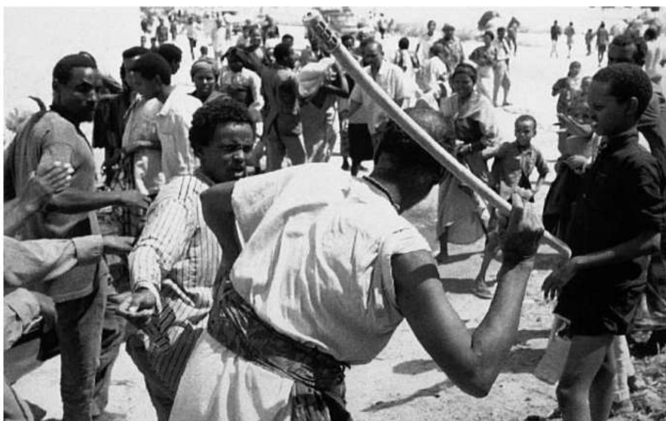
An elderly Somali man (front) fights to retain the sack of rice he has stolen from a feeding center during looting in Mogadishu, Jan. 9, 1993.

The country suffered a 30-year boycott for the sin of separating itself from a state defined by genocidal violence and starvation – Israel righted a historic wrong