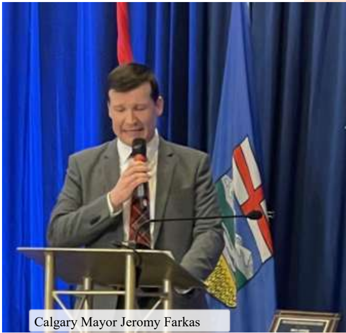
Calgary Mayor Jeremy Farkas