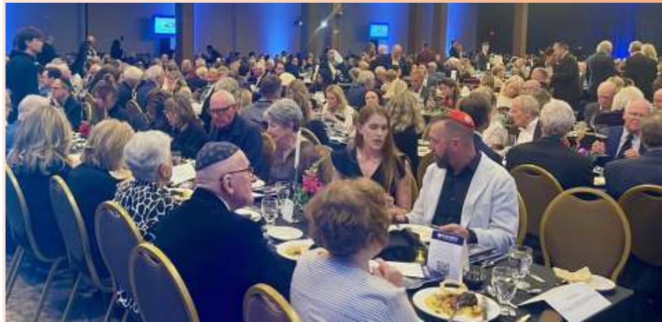
700 Guests in Attendance