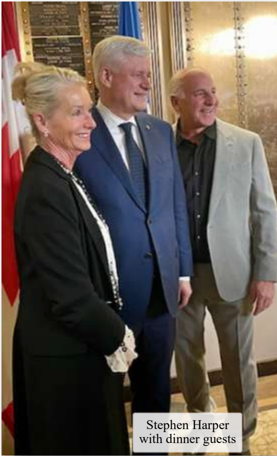
Stephen Harper with dinner guests