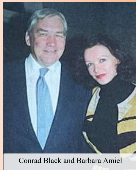
Conrad Black and Barbara Amiel