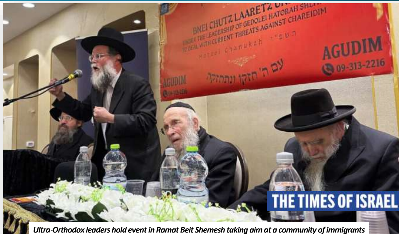
Ultra-Orthodox leaders hold event in Ramat Beit Shemesh taking aim at a community of immigrants thought more likely to enlist than other Haredim, drawing small crowd of protesters

Hundreds of members of Israel's ultra-Orthodox community gathered at Jerusalem's Mount Herzl military cemetery to accompany one of their own to his final resting place.