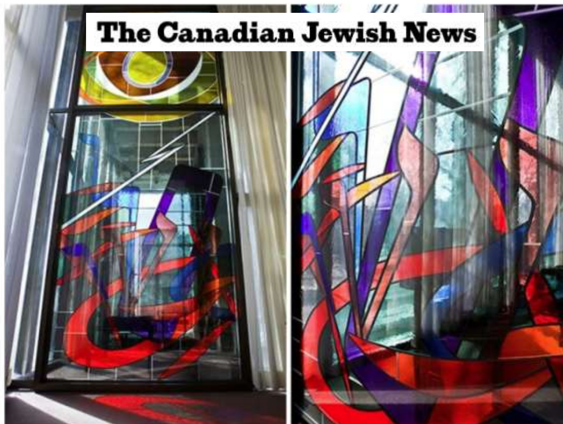
Stained glass murals by Marcelle Ferron to be installed at the Montreal Holocaust Museum.