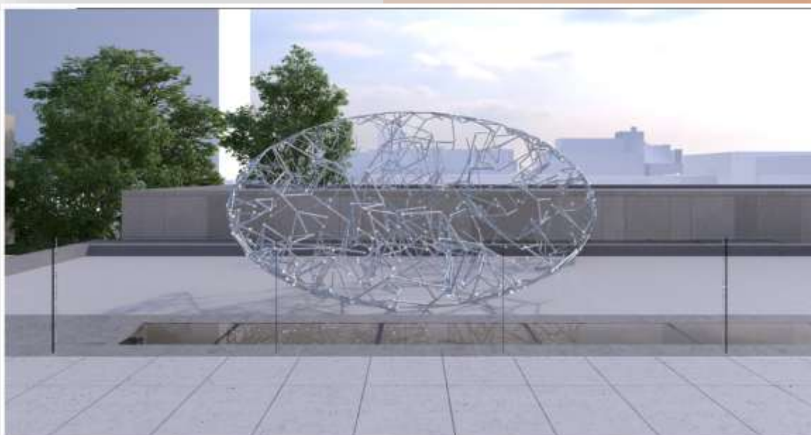
Candelabra by Nicolai Baier, at the Montreal Holocaust Museum.

Artwork at Montreal's new Holocaust museum