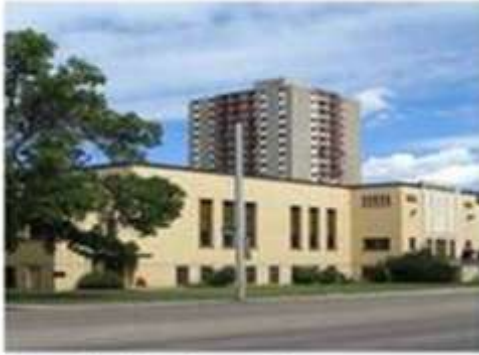
Beth Shalom Synagogue A Welcoming Shul for All!